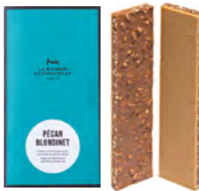
PÉCAN BLONDINET Milk chocolate, crunchy pecan pieces and a delicate layer of caramelized white chocolate. 0.21 lb – $22