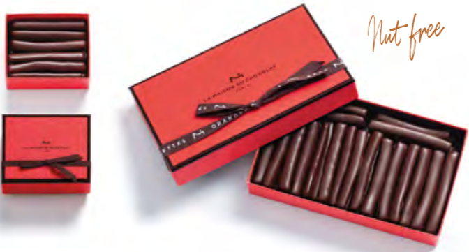
ORANGETTES GIFT BOXES Candied orange enrobed in dark chocolate. Approx. 15 pieces – 0.11 lb – $29 Approx. 68 pieces – 0.50 lb – $95