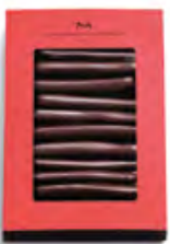
ORANGETTES Fine strips of candied orange enrobed in a delicate layer of dark chocolate which heightens the taste of the fruit. Approx. 38 pieces – 0.31 lb – $53