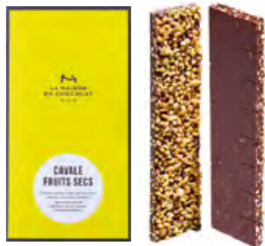
CAVALE FRUITS SECS Dark chocolate covered with slivers of nuts: almonds, hazelnuts, and pistachios. 0.22 lb – $22