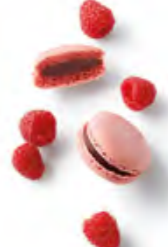
SALVADOR Ganache with raspberry pulp.

The products reflect the pricing policy in effect the day of your order. The general product pricing may be revised at any time by La Maison du Chocolat. Our products are alcohol-free except for the Effervescence gift box and the Fine Champagne Truffles gift box. RECOMMENDATIONS FOR OPTIMAL STORAGE: In order to preserve the quality, taste and texture of our chocolates, we recommend storing them in an air-tight sealed container in the refrigerator. Before enjoying, place them at room temperature for 2 hours.