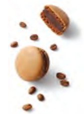
ABYSSINIE Dark chocolate ganache flavored with a cold infusion of ground coffee enhanced with a touch of mascarpone.