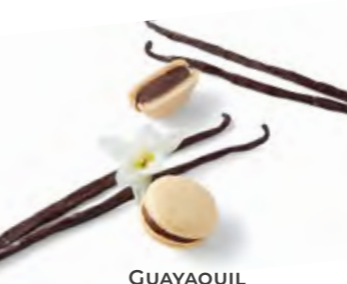
GUAYAQUIL Dark chocolate ganache infused with Bourbon vanilla.