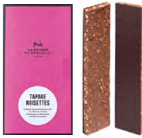
TAPAGE NOISETTES Dark chocolate on milk chocolate with slivers of hazelnut. 0.21 lb – $22