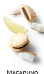
MACAPUNO Dark chocolate ganache with coconut and lime, shells topped with coconut flakes.