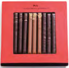
TWIGS Delicate praliné twigs gently whipped for a light, crunchy treat. Three recipes: slivers of caramelized biscuit, roasted coconut and slivers of crispy crêpes. 9 pieces – 0.14 lb – $33