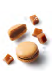
RIGOLETTO Ganache with handmade salted caramel.