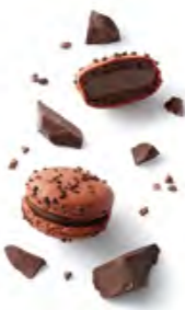
VENEZUELA Dark chocolate ganache with a woody character, shells accented with crunchy cocoa nibs.