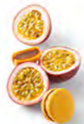
MARACUJA Ganache with passionfruit pulp.