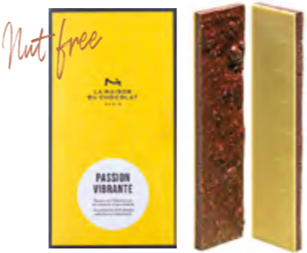
Nut free PASSION VIBRANTE Passion fruit on dark chocolate with slivers of crispy wafers. 0.21 lb – $22