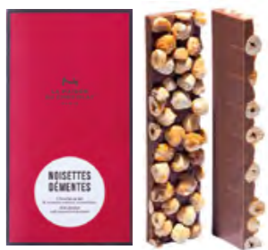
NOISETTES DÉMENTES Milk chocolate with caramelized hazelnuts. 0.24 lb – $22