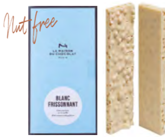
Nut free BLANC FRISSONNANT White chocolate with puffed rice. 0.17 lb – $22