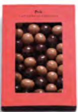
AVELINAS Hazelnuts enrobed in dark and milk chocolate. Approx. 40 pieces – 0.24 lb – $33