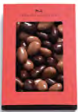
AMANDAS Almonds enrobed in milk and dark chocolate. Approx. 40 pieces – 0.26 lb – $33

Delicious in any season, La Maison du Chocolat invites you to enjoy sharing and indulging in gourmet treats all year round. Their shape, their size, their crispy/crunchy dark or milk chocolate... every aspect has us hooked. These nostalgic delights satisfy any chocolate craving and are designed to please everyone.