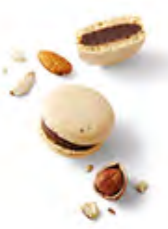
FIGARO Dark chocolate ganache with hazelnut almond praliné and hazelnut paste.