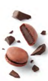
QUITO Robust dark chocolate ganache, intense and distinctive.

Immediately recognizable, the macarons of La Maison du Chocolat are filled exclusively with signature ganache. They are available in eleven different flavors. Their smooth shiny shells are sometimes embellished with natural pigments, that give them an elegant pastel hue. These two shells, which embrace a heart of chocolate, are made from French meringue, and are silkier and less sweet than the Italian version. They have a perfect balance of flavor.