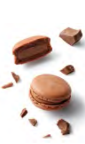
SYLVIA Sweet luscious milk chocolate ganache with subtle notes of caramel.