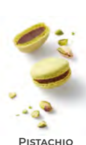
PISTACHIO Ganache with pistachio paste.