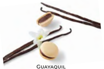
Dark chocolate ganache infused with Bourbon vanilla.